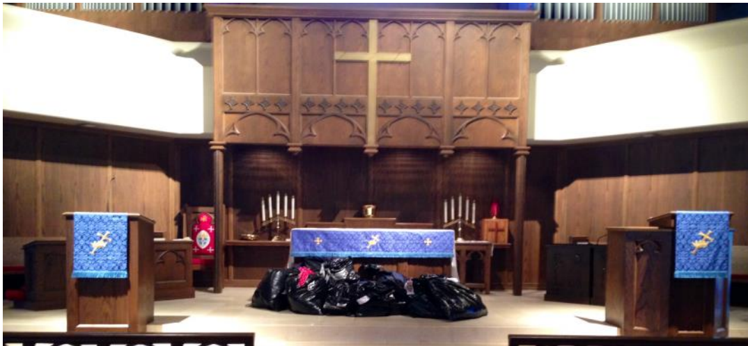
Why Blue During Advent?